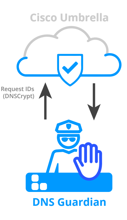
Simple, Fast, Secure Deployment

The combination of Cisco Umbrella and EfficientIP technologies extends the enterprise security perimeter and strengthens network defenses. The technology alliance combines threat intelligence services to protect against malicious domains, with behavioral detection of attacks and adaptive security. It offers a best-of-breed market solution to defend against the widest range of DNS menaces, protecting on and off-network users, safeguarding data confidentiality and ensuring both internal and external service continuity.