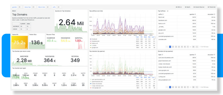
Slice data by server, query type, return code, or suffix to troubleshoot quickly

Once an anomaly is identified from the DDI OC portal, it can be immediately investigated to determine its nature, such as an operational or capacity issue, misconfiguration, or security threat. Continuous historical records and detailed metrics facilitate troubleshooting, which is accelerated by correlating related metrics from the portal.