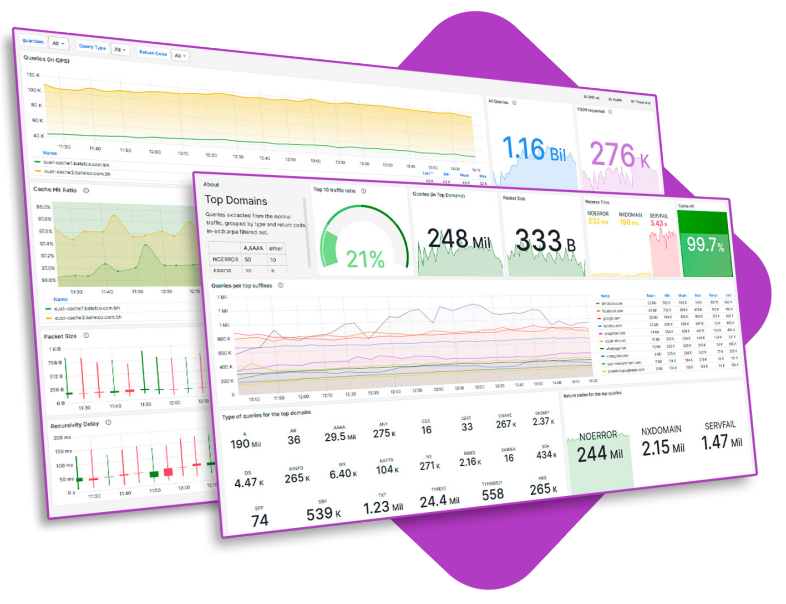
Extensive DDI telemetry from a unified visualization portal

Simple, pre-built dashboards, including widgets, allow teams to easily search, filter, and browse historical DDI and DNS telemetry. They also enable zooming in and out with a visual timeline to spot trends and spikes as well as go deeper to find where the problem really lies. Widgets can be embedded into third-party business applications for broader access and monitoring.