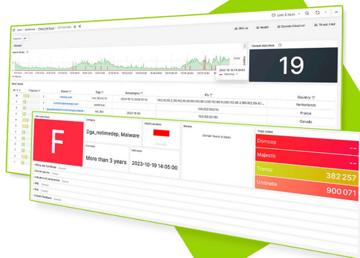
DNS analytics and intelligence dashboards, available from a unified visualization portal